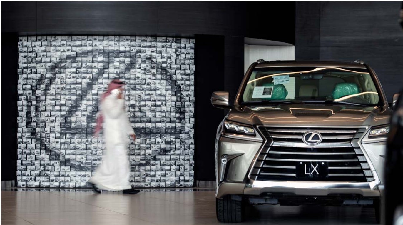
ALJ Motors operates a network of distributorships and dealerships, including this Lexus center in Riyadh.

so it will certainly vary from country to country. In the Gulf, the automotive sector has been slower to adapt to change compared with other industries, but there are some exciting advances taking place. For example, electric-vehicle charging stations have made their way into Saudi Arabia. And recently Saudi Arabia announced that NEOM, “the land of the future,” 1 will have fully autonomous mobility by 2030, with only electric vehicles and public transport. So, we have a lot to look forward to in the next decade.